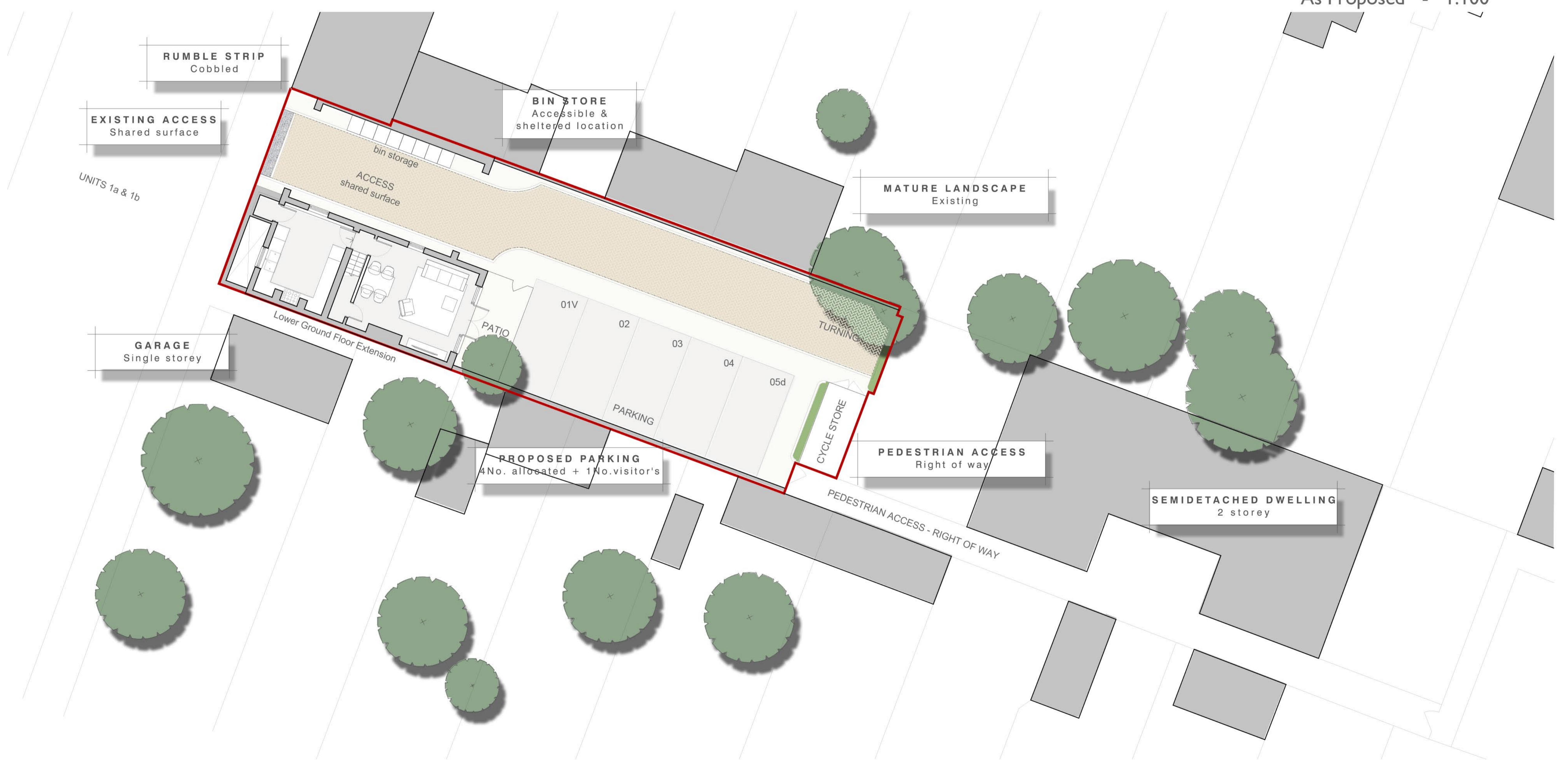
Site Plan As Proposed - 1:100