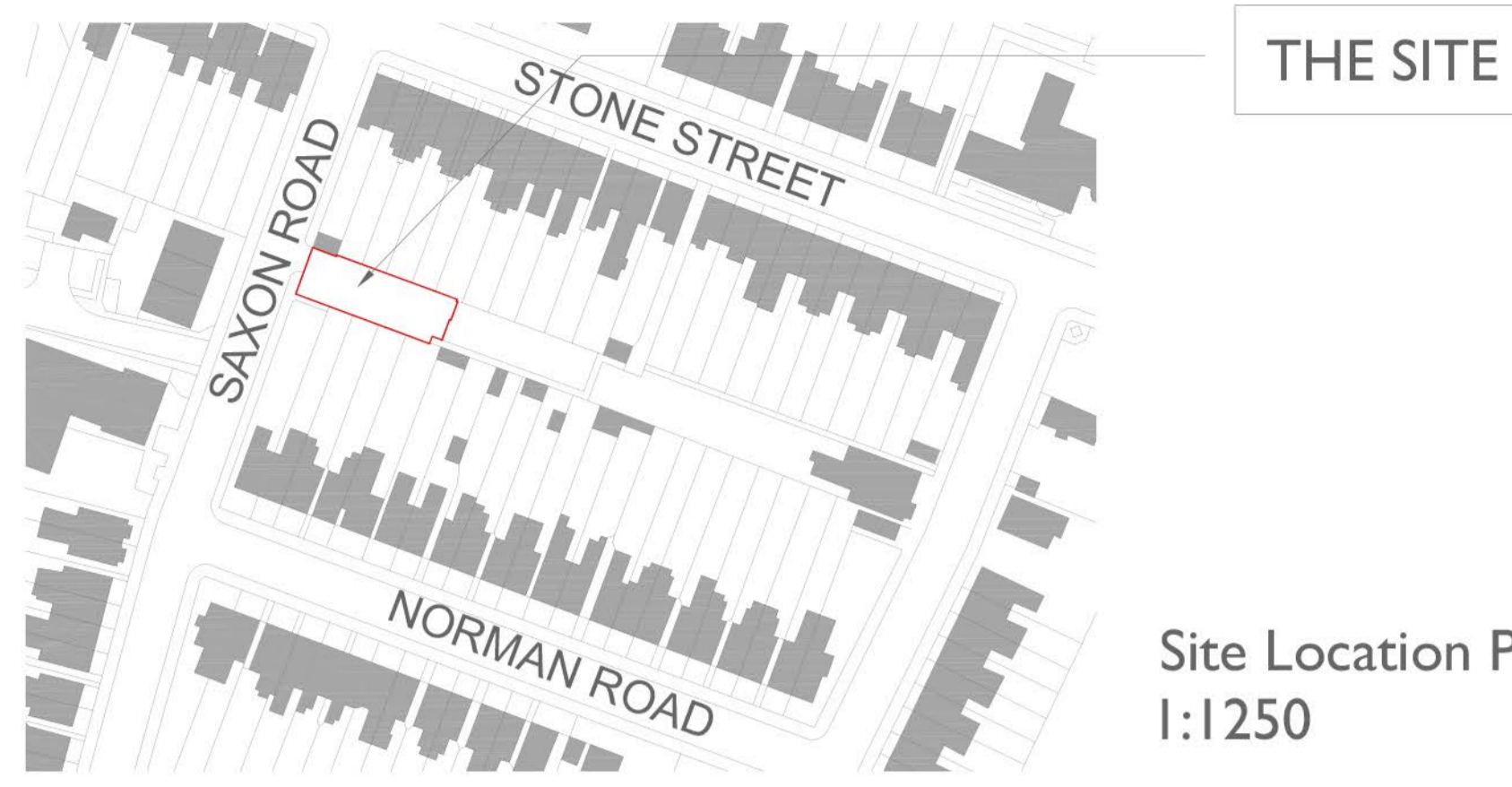
THE SITE Site Location Plan 1:1250